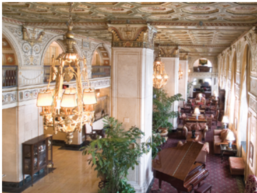
Brown Hotel, Louisville, Kentucky.