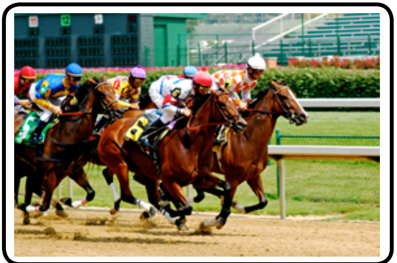
Churchill Downs.