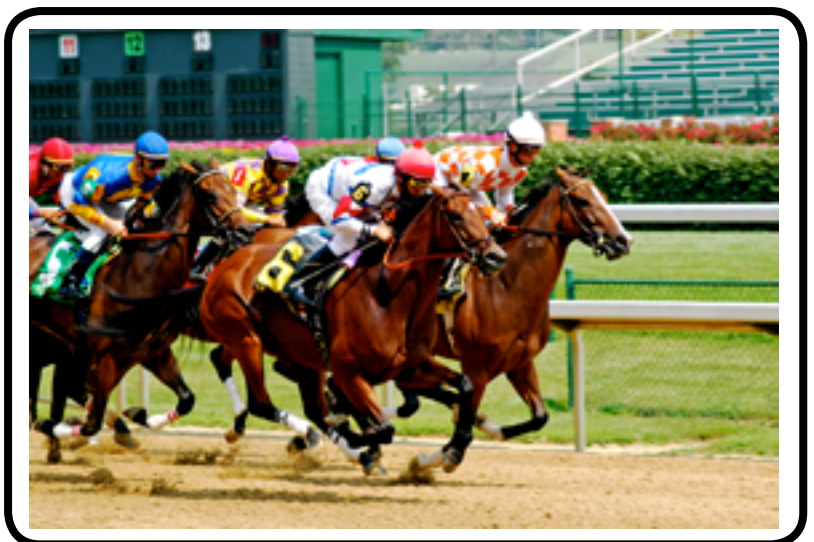
Churchill Downs.