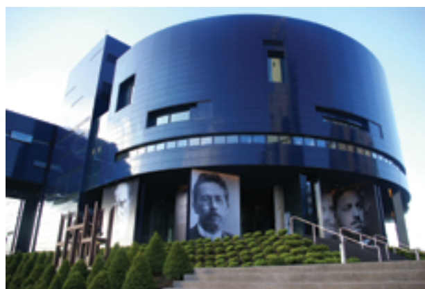
Guthrie Theater, Downtown Minneapolis