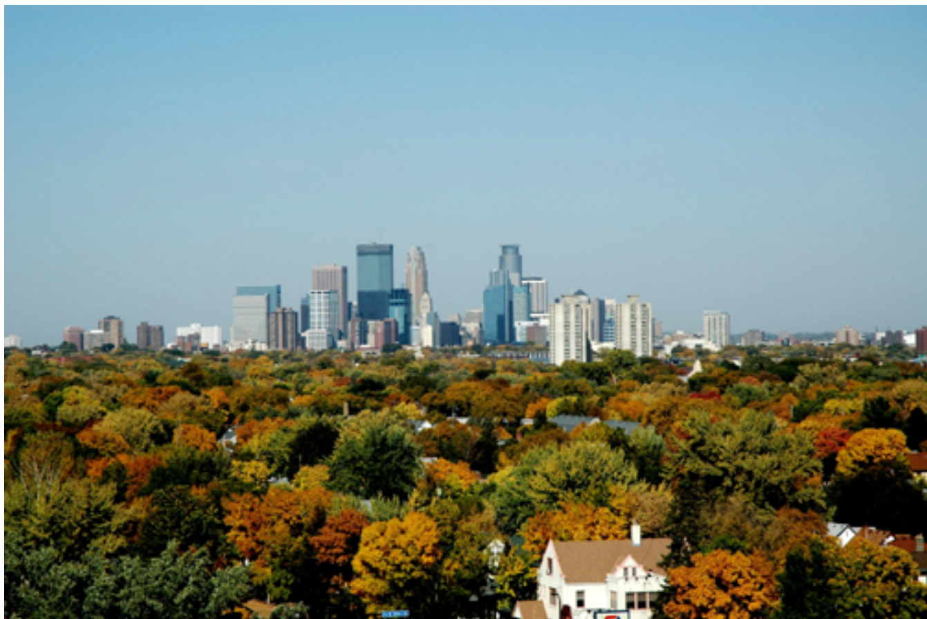
Minneapolis Skyline.